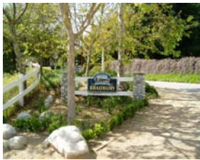
Welcome to Bradbury

For the most part, crime within the City of Bradbury has remained continually low, and with a few extra precautions, we can keep it that way!